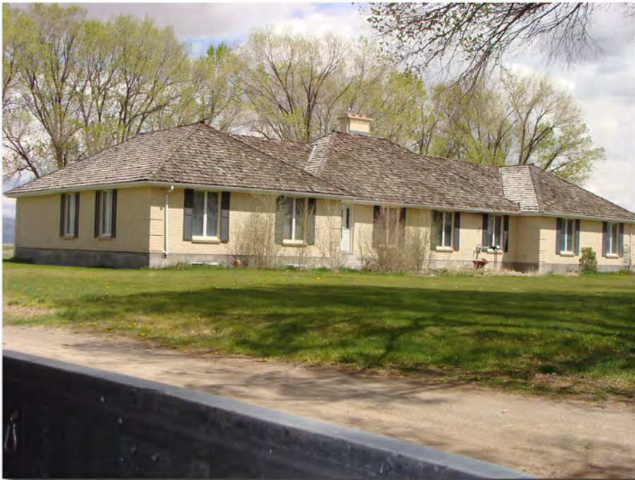
3 bedroom owner home with full basement - recently remodeled.