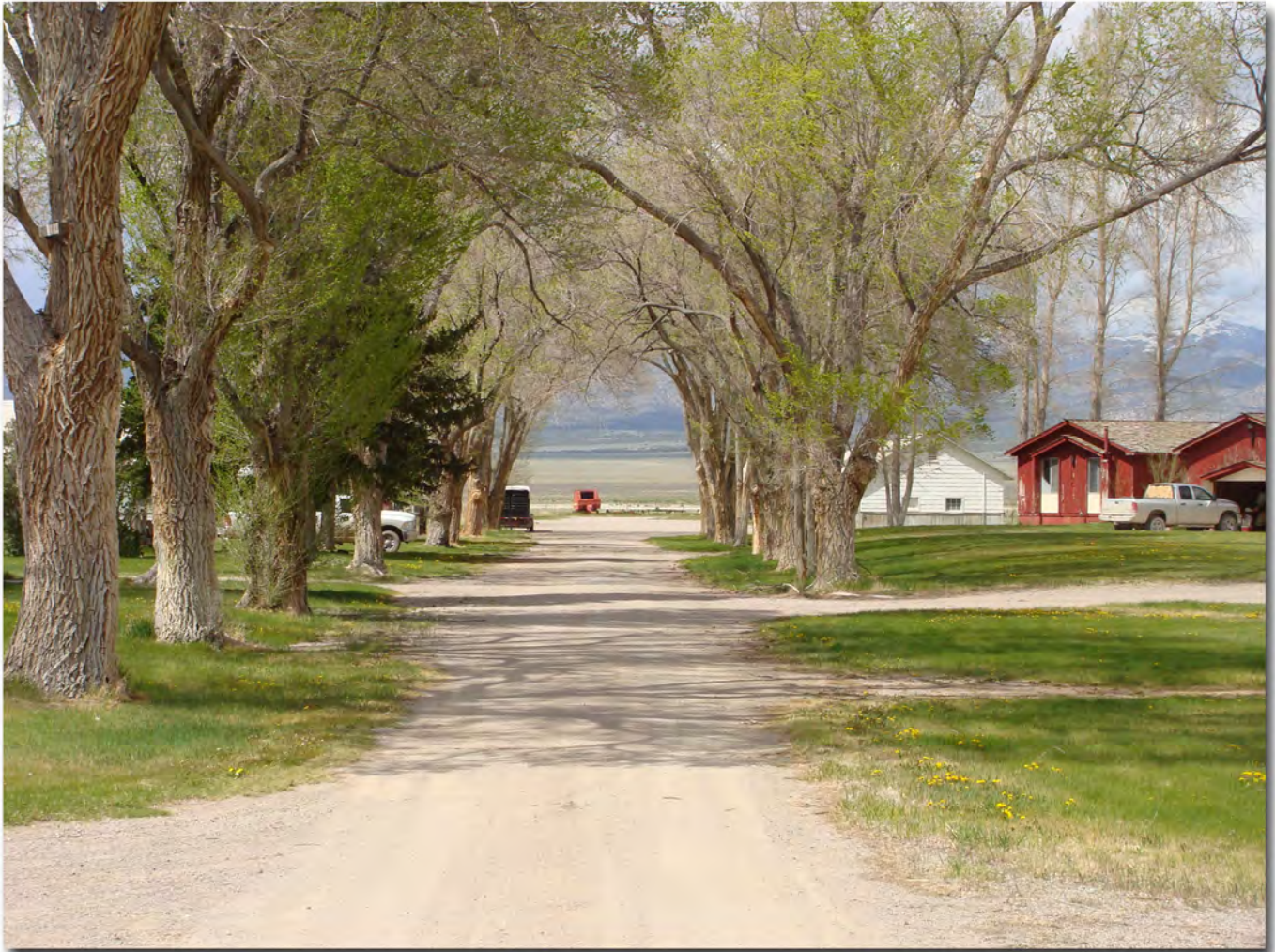
Entance to the ranch