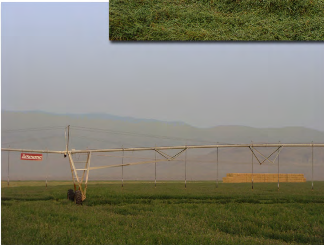
All Zimmatic pivots