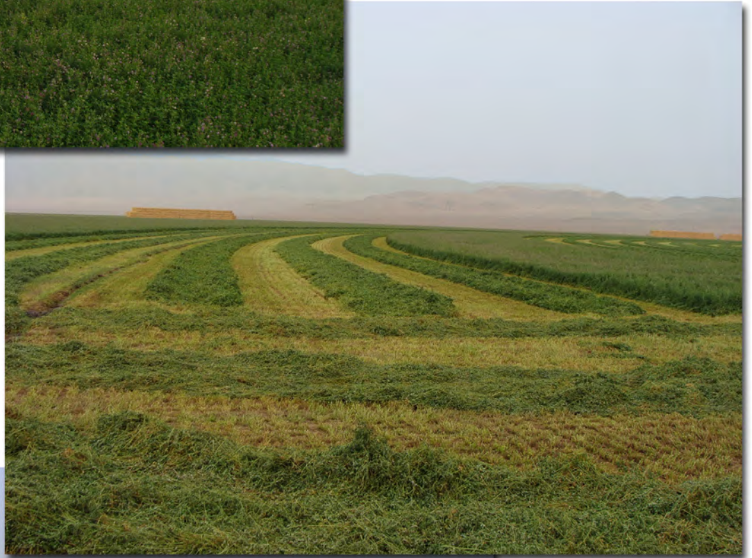
Big windrows third crop