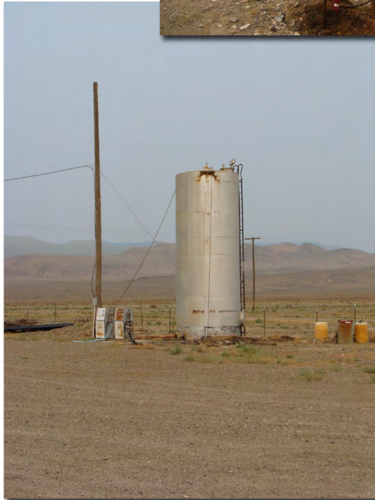
Equipment fueling station