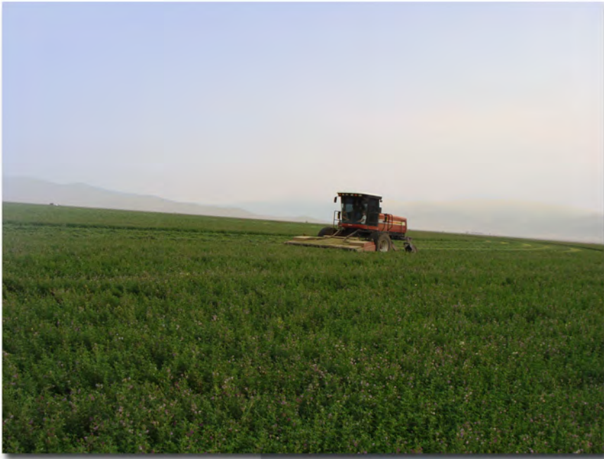
Second year alfalfa