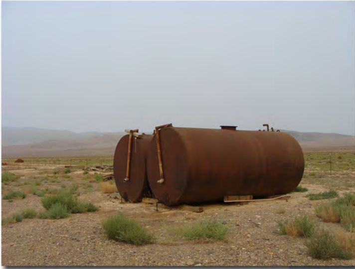
Fuel storage tanks and diesel generators